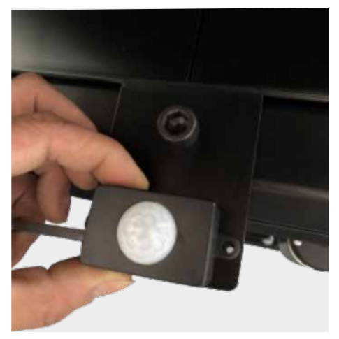
Step 3: Place one sensor (1) on the bracket and align the mounting holes. Use two sets of screw (2) and nut (3) to fix the sensor. Use Allen key (4) to secure.