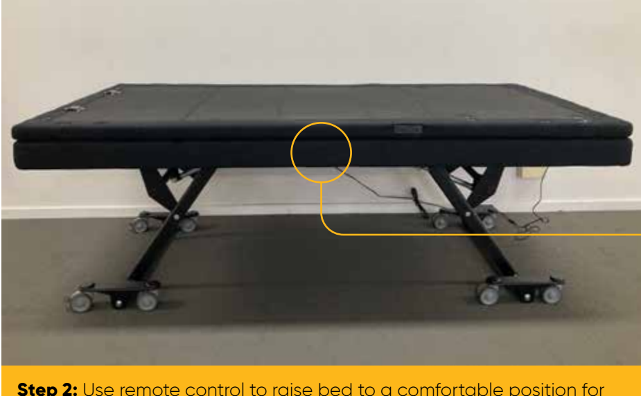
Step 2: Use remote control to raise bed to a comfortable position for installation