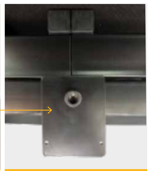
Locate mounting bracket on bed frame.