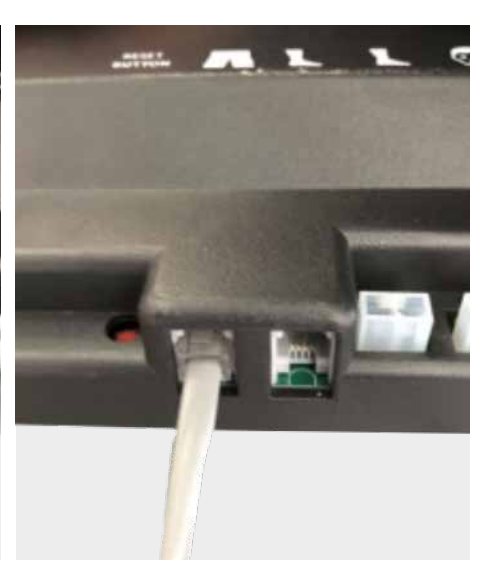
Step 6: Connect the other sensor (1) to control box by repeating the above step.

Note: If the bed is purchased with this accessory, it may be installed while the bed is still in the box (bed is upside down when it was boxed) for easy access to control box under the bed.